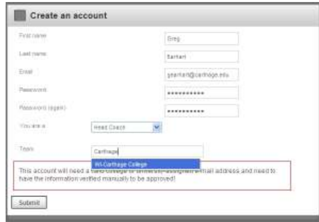
Figure 1-Create an account

Once you've logged in, you can take advantage of the several tools from the control panel (figure 2).